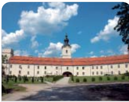
Cistercian abbey in Sulejów

The first 4-star deluxe design hotel in Łódź will open with 278 rooms, ballroom of 1,328 m 2 and 7 conference rooms. Located on the grounds of the Manufaktura commercial centre honoured for Best European shopping centre.