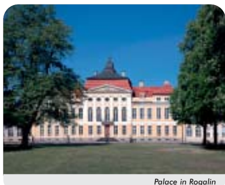
Palace in Rogalin