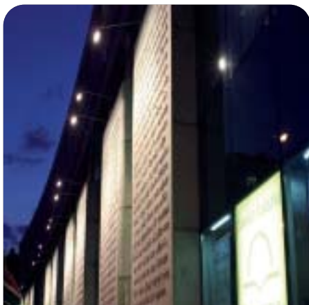
Warsaw University Library

in a fantastic atmosphere of an old confectionery, you may taste some of the best real drinking chocolates.