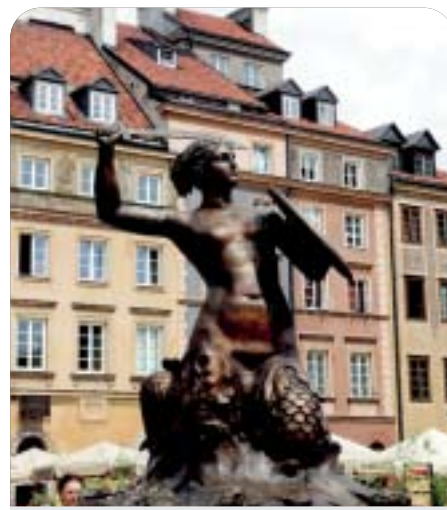
The Warsaw mermaid