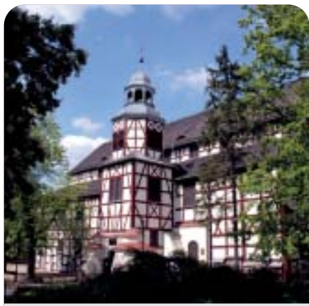
Church of Peace in Jawor