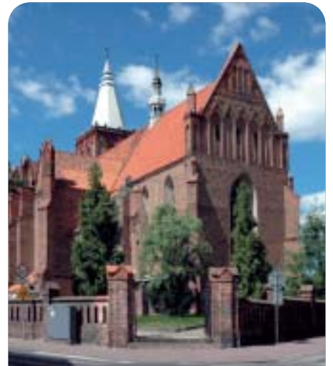
Cathedral in Chełmno

BYDGOSZCZ I.J. PADEREWSKI AIRPORT (35km from Toruń) www.plb.pl