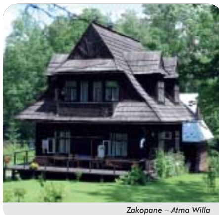
Zakopane – Atma Willa