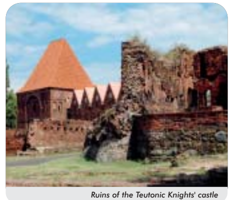
Ruins of the Teutonic Knights' castle