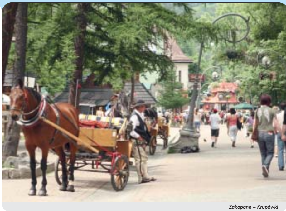
Zakopane – Krupówki

Located in the centre, with a beautiful view of the Tatra mountain range. A historical building in the Zakopane folk style built in 1906, fully renovated. 54 rooms with bathrooms, and satellite TV, telephone, Internet access, minibar, hairdryer. Guests may use: restaurant, bar, wellness & spa centre (sauna, solarium, Jacuzzi, gym, swimming pool, beauty parlour), room service, unattended car park.