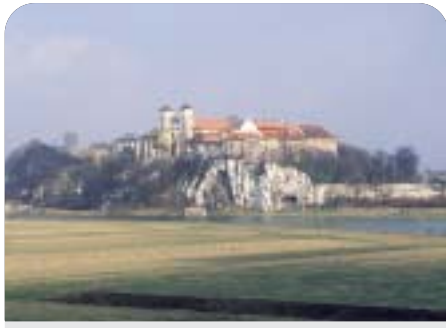
Abbey in Tyniec