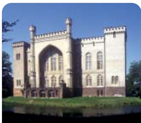
Castle in Kórnik