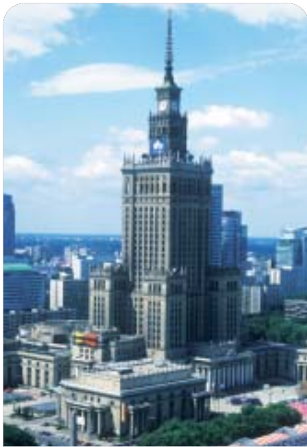
Palace of Culture and Science