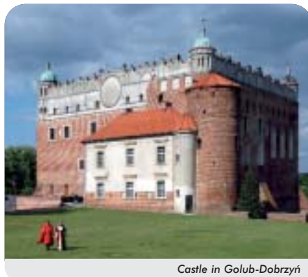
Castle in Golub-Dobrzyń

kinds will overwhelm you. All the meals are based on the traditional Polish eastern grandma's recipes.