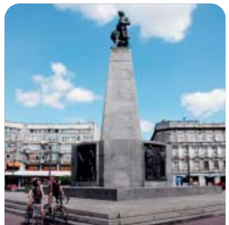
Łódź – Plac Wolności