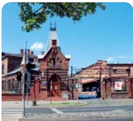
Warsaw – old Praga district

WARSAW FRÉDÉRIC CHOPIN AIRPORT – OKĘCIE www.lotnisko-chopina.pl