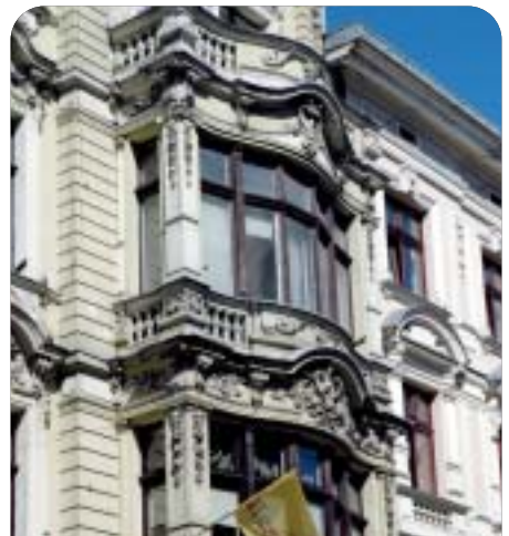
Łódź – historical house in Piotrkowska Street