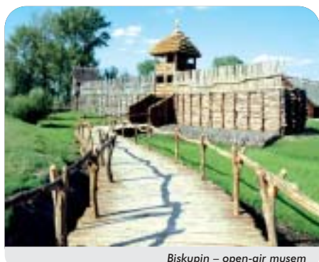
Biskupin – open-air museum

Poland, the St. Peter and Paul Basilica. The basilica is the resting place of the first members of the Piast dynasty.