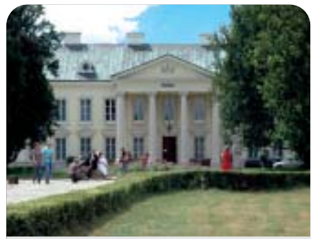
Palace in Walewice